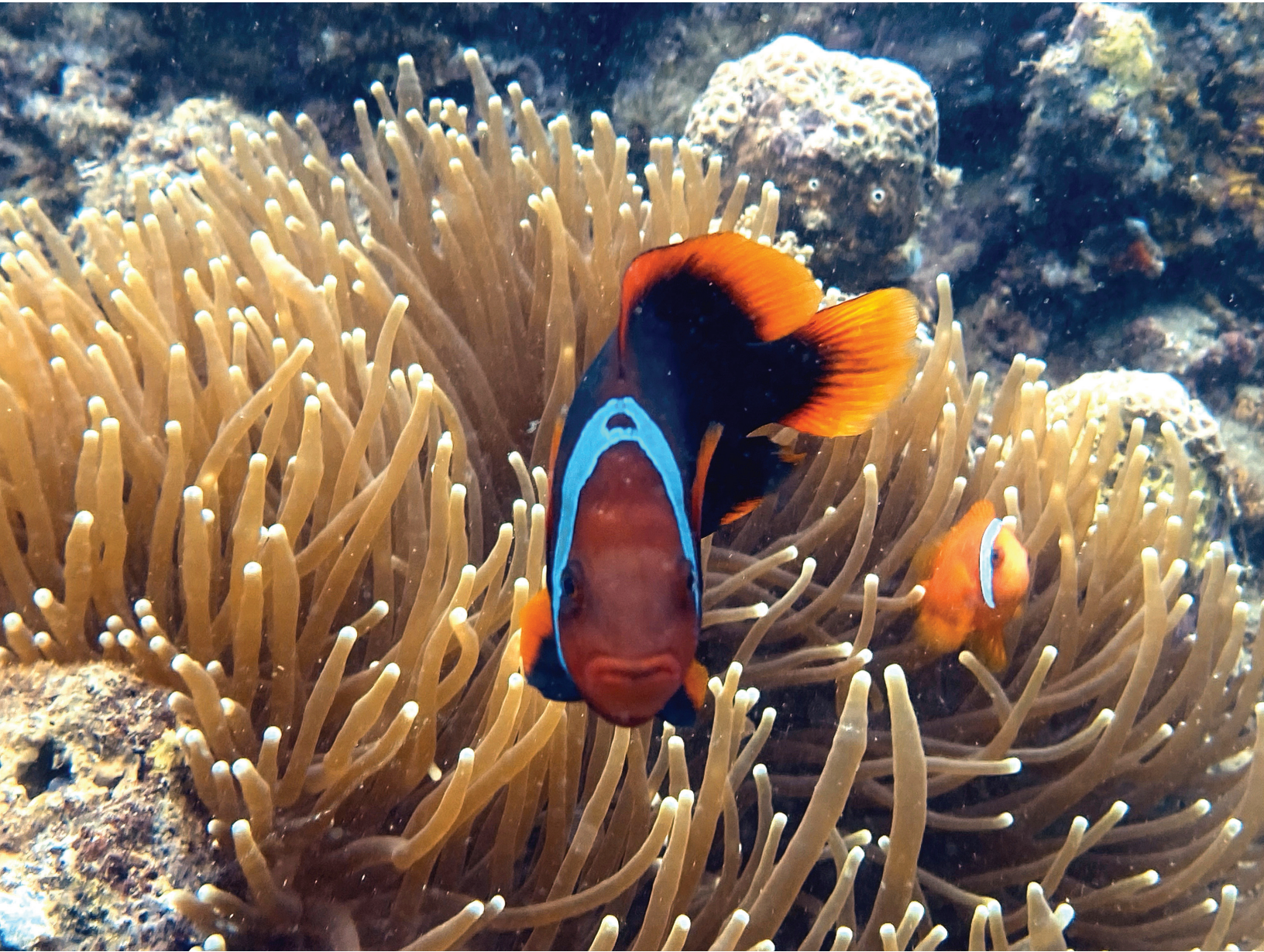
Marine life in Batangas. Healthy coral is critical for maintaining ocean biodiversity, Philippines.