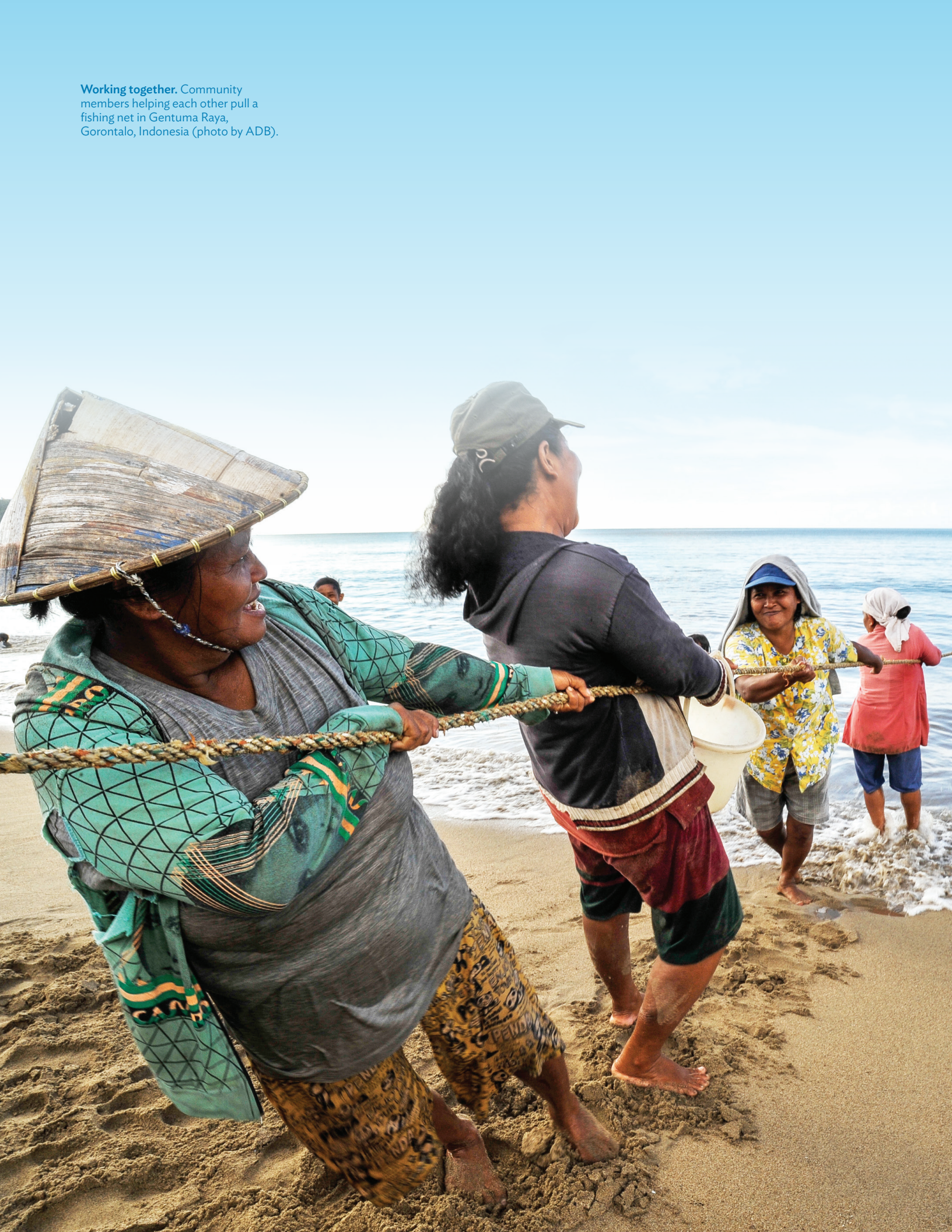
Working together. Community members helping each other pull a fishing net in Gentuma Raya, Gorontalo, Indonesia (photo by ADB).